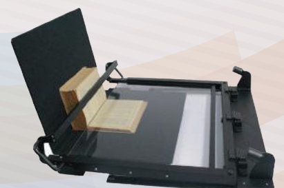
V-Shape Book Holder