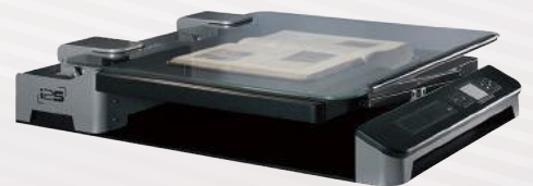
Motorized Book Cradle