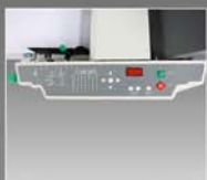
RD-298A Control panel