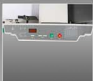
RD-297 Control panel