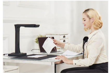
Accounting / Finance