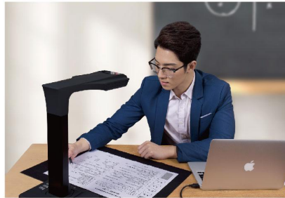
University / School