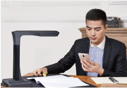
Law / CPA Firm

Scan book, magazine, drawing, picture, blueprint, receipt and so on.